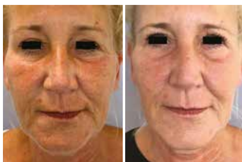
Figure 3 (Left) Before and (Right) after 3 sessions with 2 weeks intervals with CELLBOOSTER® Glow.

► *Medical Devices Class III, regulated health products bearing the CE marking (CE 0373). Only to be administered by appropriately trained healthcare professionals who are qualified or accredited in accordance with national law.