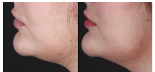
Figure 2 (Left) before and (Right) after double chin treatment using 3 sessions with 2 weeks intervals with CELLBOOSTER® Shape, Pictures courtesy of Dr. Marco Cerrano (Switzerland)