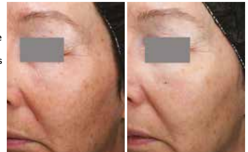
Figure 4 (Left) Before and (Right) after 3 sessions with 2 weeks intervals with CELLBOOSTER® Lift.